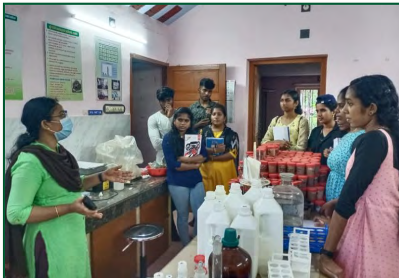
Students Attending Practicals - Soil Sampling & Testing